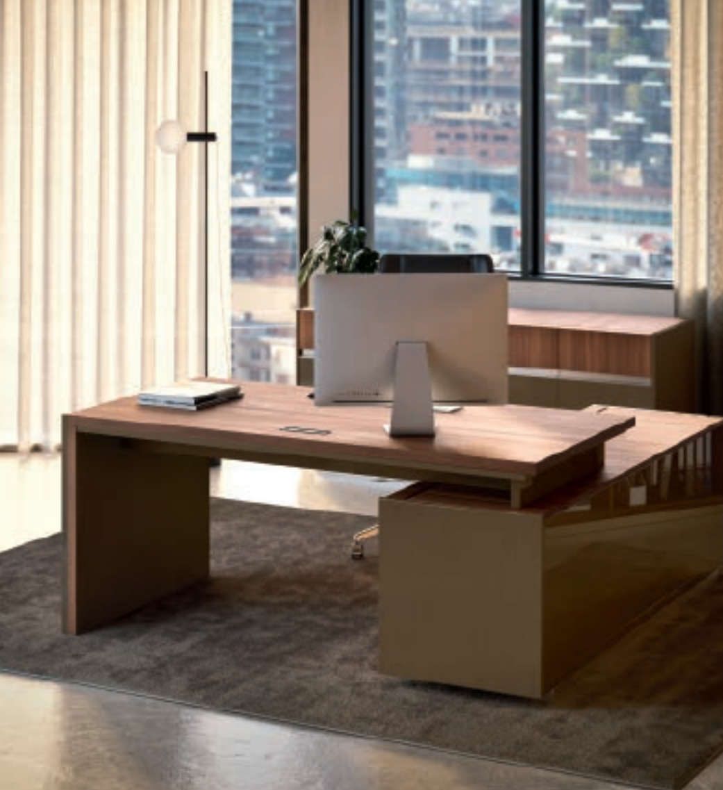
Porta Romana Office, Milanese interior