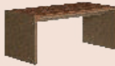
SUPPORTING DESK W 180 PJPR0780 To match with KJPR705 or KJPR706 featuring adjustable feet levellers

inch W 66" D 34" H 30" cm L 167 P 86 H 76 Crts 3 kg 78 m 3 0,33