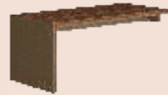
SUPPORTING DESK W 167 PJPR0781 To match with KJPR705 or KJPR706 featuring adjustable feet levellers

inch W 19" D 19" H 23" cm L 47,4 P 47,9 H 59,5 Crts 1 kg 34 m 3 0,18