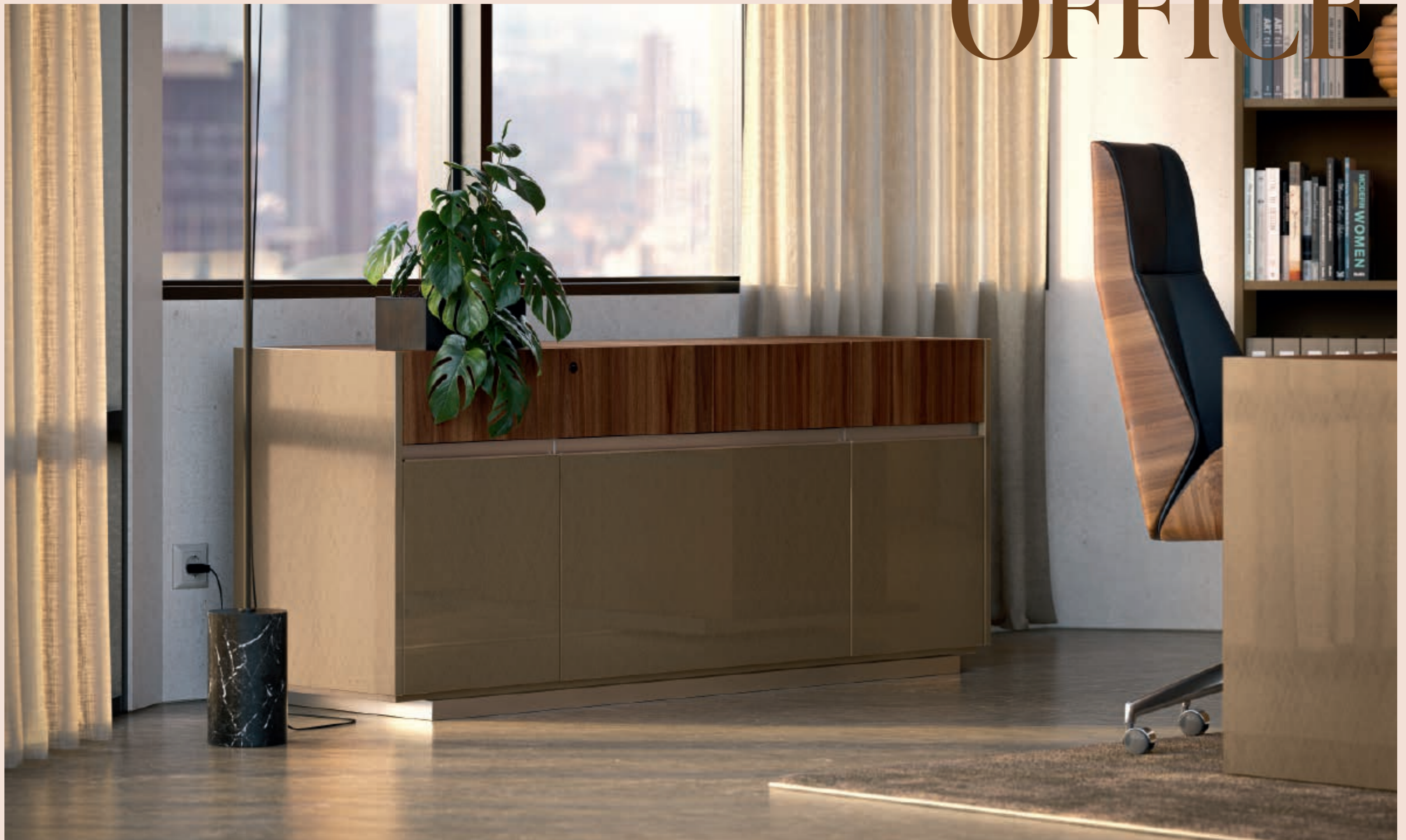
Porta Romana Office, Milanese interior