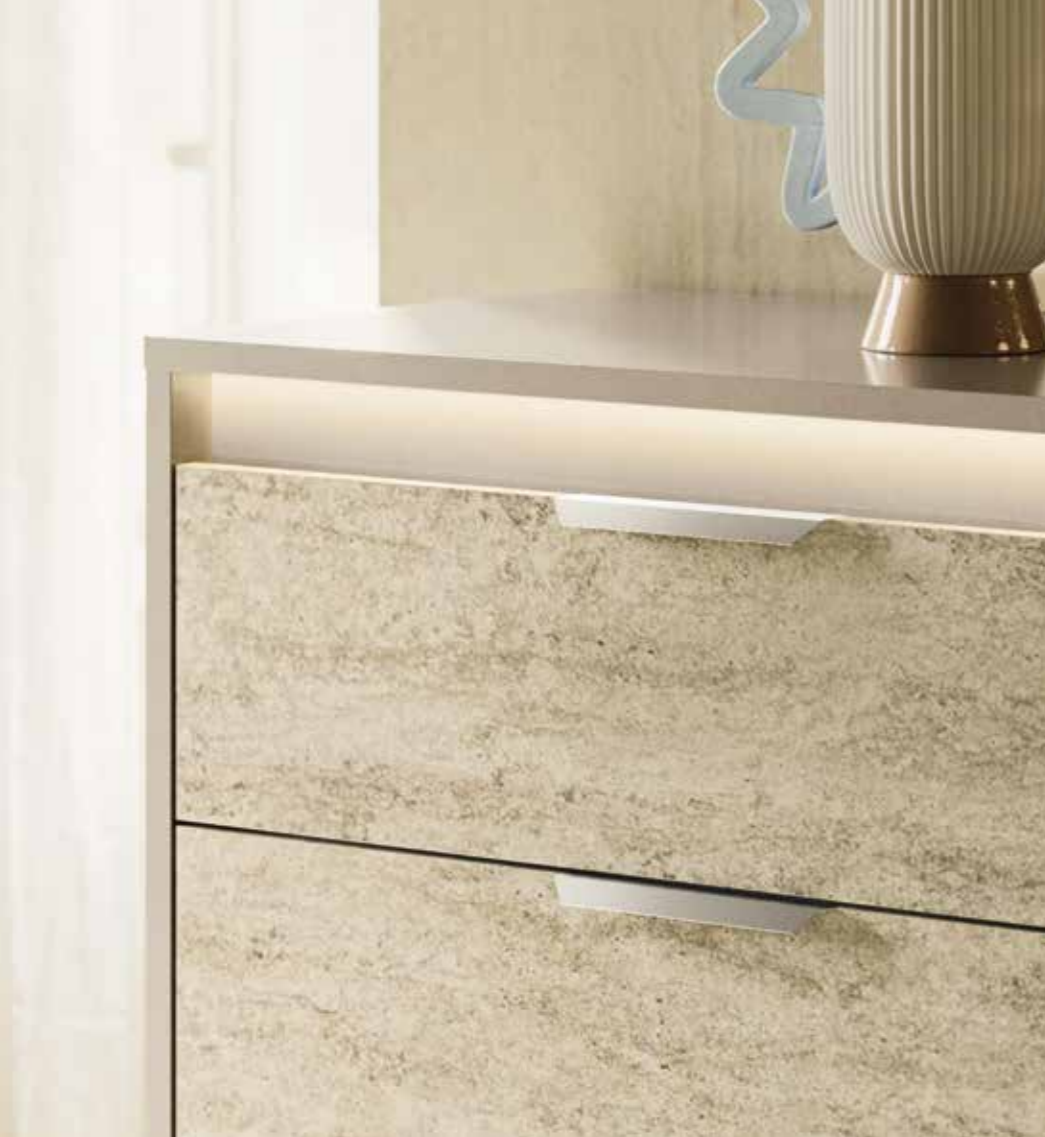
Tullia bedroom set, Neapolitan interior

The dresser features Travertino Eco Stone fronts and a sleek Pearl Line high gloss finish. Integrated lighting creates a soft, inviting glow, highlighting the elegant design. Clean lines and refined details add a touch of modern sophistication.