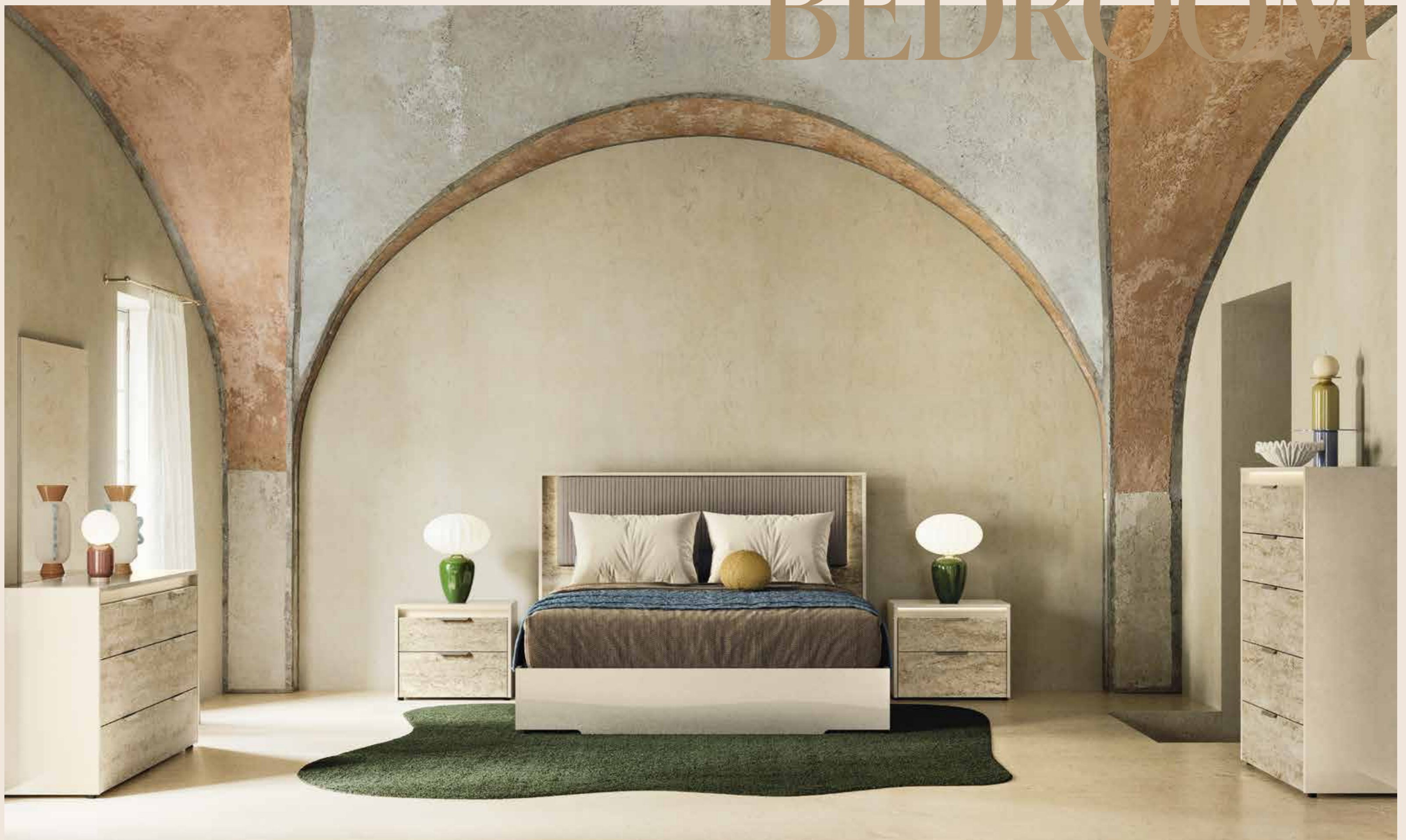
Tullia bedroom set, Neapolitan interior